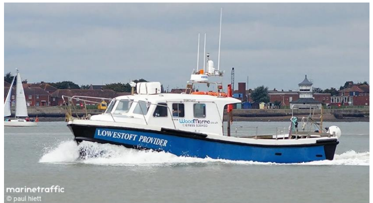
marinetraffic © paul hieft

This chart shows the planned survey area where operations will be undertaken.